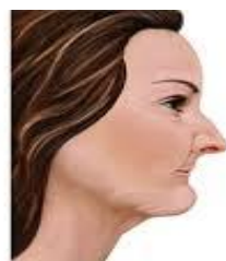
after bone loss

Cost: RM400-800 (Bone + Membrane) Please plan the bone preservation before the extraction.