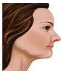
after tooth loss