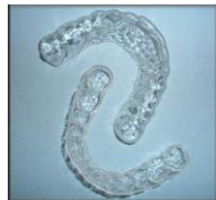
Special Order Soft Plastic