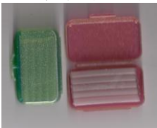
"Emergency" Soft Wax