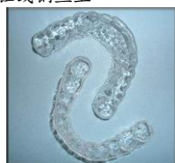
Special Order Soft Plastic