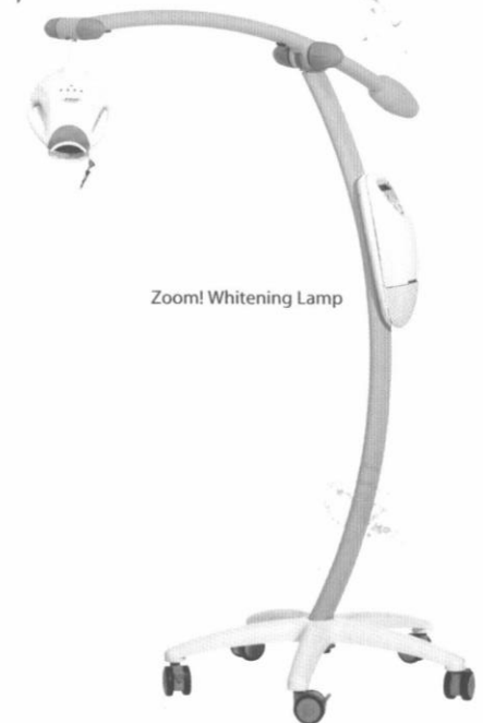
Zoom! Whitening Lamp

A: During the procedure, patients may comfortably watch television or listen to music. Many actually fall asleep. Individuals with a strong gag reflex or anxiety may have difficulty undergoing the entire procedure.